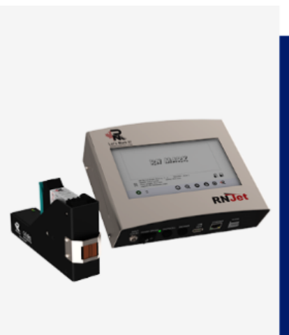
More ...ink systems In addition, thermal cartridge systems TIJ, inkjet printers DOD and high-resolution printers HI-RES are available.