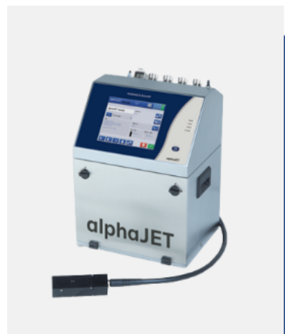
THE ENTRY-LEVEL VERSION alphaJET Mondo With integrated solvent recovery, user profile management and TrueType font printing.