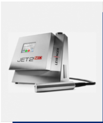
THE MOST ADAPTABLE JET2NEO Reliable, precise and adaptable, with minimal consumption and low maintenance.