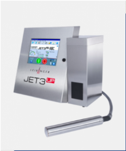
THE MOST EFFICIENT Jet3UP The expert for a wide range of special applications, for high-contrast inks, ideal for dust- and waterproof applications.