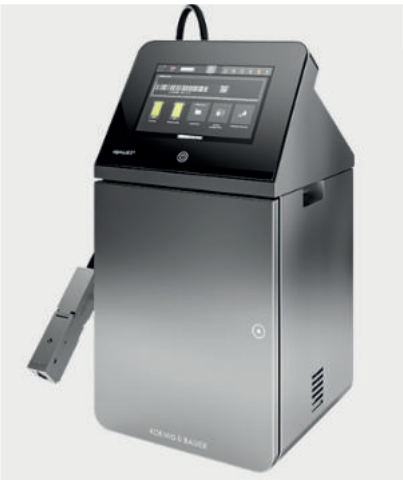
THE MOST EFFECTIVE alphaJET 5 X Reliable and sustainable product marking, print quality at the smallest marking up to 1300m/min