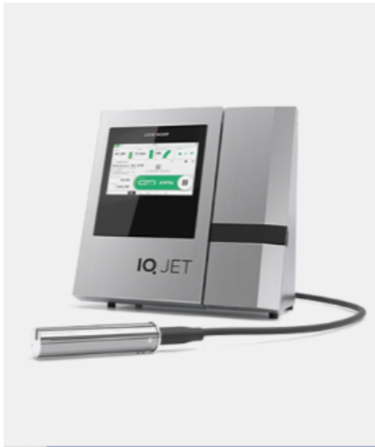
MOST INNOVATIVE IQJET Uncompromising print quality, maximum reliability and new standards in efficiency and sustainability.

«The solution for your most diverse needs.»